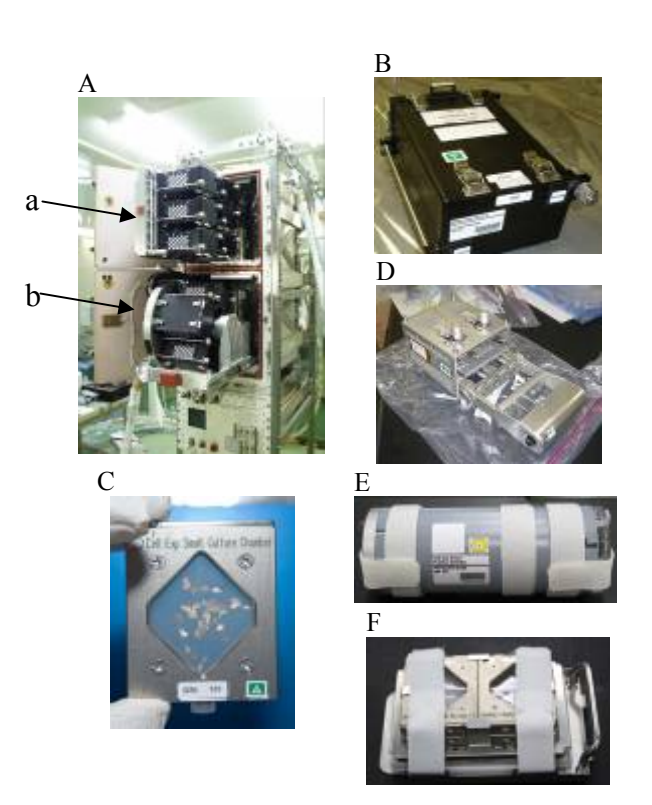
Fig. 2 Fish Scales Experiment hardware: CBEF (A) a microgravity section; "a", an artificial gravity section; "b"; MEU (B); Fish Scales culture chamber with scales (C); Pre-fixation Kit (E); Cell-fixation Kit (D); Sample holder assembly (F)