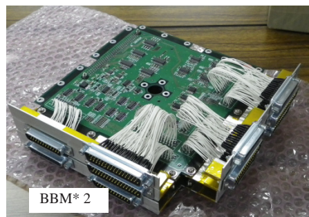
Fig. 5 OBC (On Board Computer)