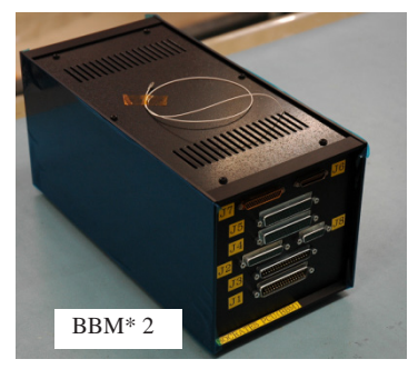
Fig. 3 PCU (Power Control Unit)

SEGR: Single Event Gate-Rapture SEL: Single Event Latch-up SEU: Single Event Upset