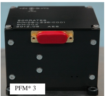
Fig. 4 VSGA (Vibrating Structure Gyroscope Assembly)