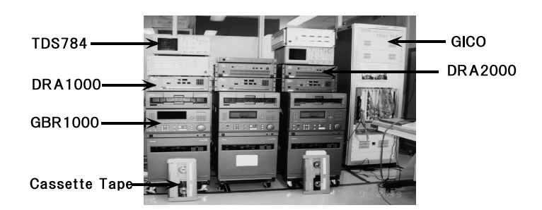
Figure 1: Giga Bit VLBI system

These observations are very sensitive and we have detected many faint sources. During these observations, we tried a real-time fringe check system. Figure 2 shows the block diagram of our real-time fringe check system. Using the DRA2000's function, a software correlator and Internet data transfer,